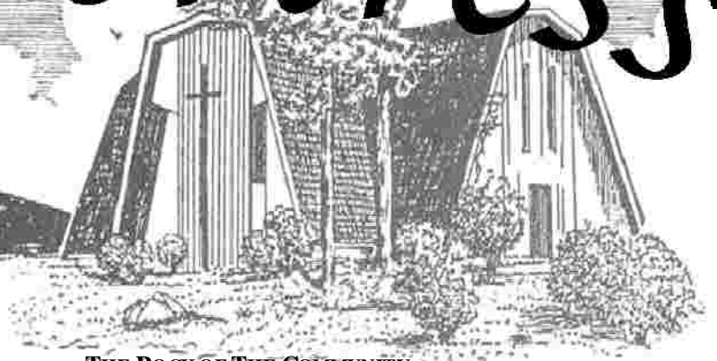
THE ROCK OF THE COMMUNITY

Rock of Ages Lutheran Church 5135 Memorial Drive | Stone Mountain, GA 30083 (Ph) 404-292-7888; (F) 404-292-7889 (Email) rockofageselca@bellsouth.net (Web) www.rock-of-ages-lutheran-church.org